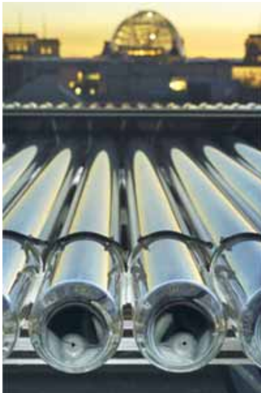
High temperature collectors that can generate up to 250 °C are still a challenge for R&D.

In order to realize the described applications and to lower costs significantly, solar thermal components and system technology must be considerably further developed. Examples are mentioned below.