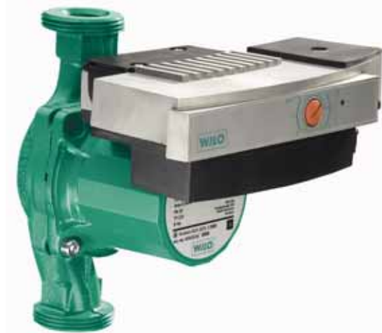
New solar pumps require up to 80% less energy.

To transport solar heat from the collector to the storage device, easy to install and well insulated solar conductors were developed from either copper or stainless steel tubes. In the future, more affordable and ever easier to install connection materials will be applied. Ionic fluids as heat transfer mediums are under investigation. Work is being done to create tubes, fixtures and safety devices with special attention to the continuously rising temperatures within the solar loop.