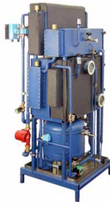
A solar cooling machine.

Furthermore, there are high hopes for solar cooling. Through this, solar heating will be applied to power absorption or evaporative cooling units. Over 50 solar cooling systems are already on-line on Europe, one example being the Federal Public Relations Office in Berlin. Unfortunately, there are only cooling units designed for large-scale use and costs are still significantly higher than conventional technologies.